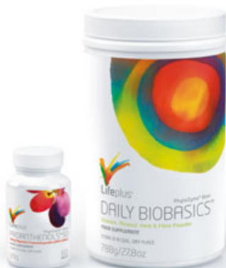
MAINTAIN & PROTECT 50 Daily BioBasics™ Proanthenols® 50 mg