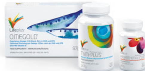
EVERYDAY WELL-BEING GOLD TVM-Plus™ Proanthenols® 100 mg OmeGold®