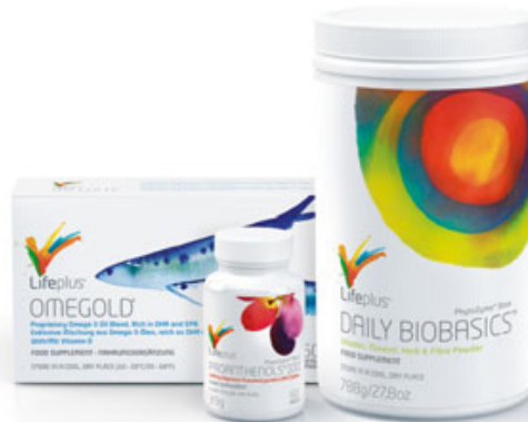
MAINTAIN & PROTECT 100 GOLD Daily BioBasics™ Proanthlenols® 100 mg OmeGold® Product 4382

Convenient and comprehensive, our Product Packs represent ideal combinations of our most popular products, carefully selected to combine and maximise the effects of the ingredients within, and provide you with the confidence that you're receiving a full range of high quality nutrients to support your well-being.