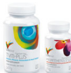
EVERYDAY WELL-BEING TVM-Plus™ Proanthenols® 100 mg