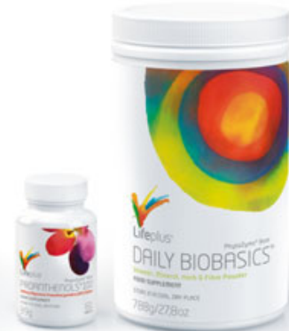
MAINTAIN & PROTECT 100 Daily BioBasics™ Proanthlenols® 100 mg Product 4630